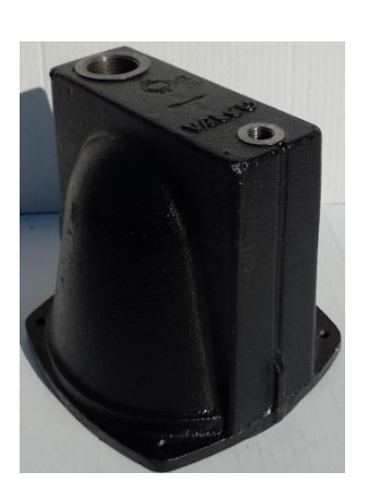
MOULDS FOR CAST IRON PUMP MOTOR BRACKET